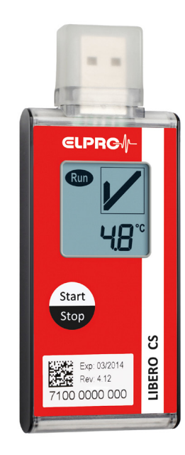
Multi-Level PDF Logger

With LIBERO C and liberoMANAGER, ELPRO offers the most complete and cost-effective Cold Chain Monitoring Solution ever. From production to distribution to the final site, the LIBERO C portfolio and liberoMANAGER are applicable for any step in the cold chain. The LIBERO C portfolio now includes a Multi-Level PDF Indicator. No software to send, no software to receive, no software for reporting and no software for data warehousing – we call it the most complete no-software solution. Designed for pharmaceutical companies with complex distribution chains for commercial products and clinical trials. All components are fully qualified according to GAMP5 and compliant to CFR 21 part 11.